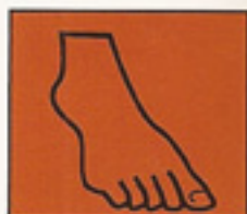
1 Minute: each sole