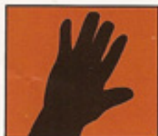
1 Minute: each palm