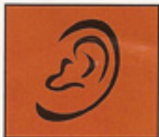
1 Minute: each ear